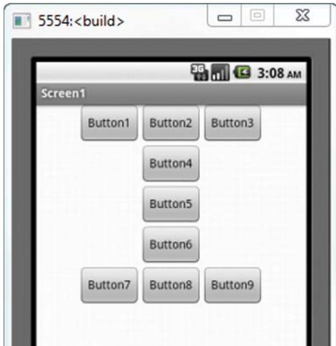
Figure 2-84 Screen Layout for Exercise 3