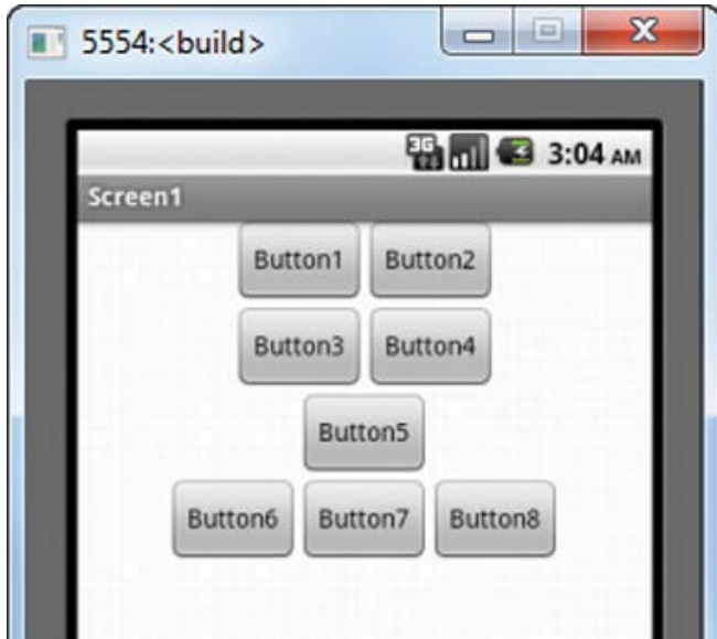
Figure 2-83 Screen Layout for Exercise 3