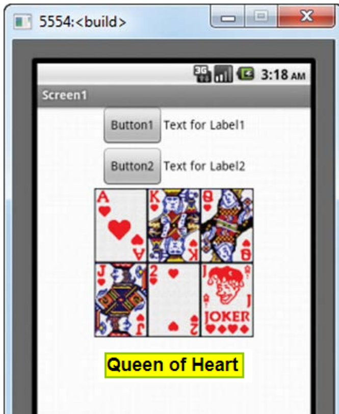
Figure 2-85 Screen Layout for Exercise 3

(The card images in Figure 2-85 can be found in the website.)